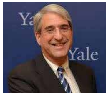
Yale President Peter Salovey to attend YaleBoston 150th Anniversary Gala at the Parker House

More to come in our e-newsletter and on our website!