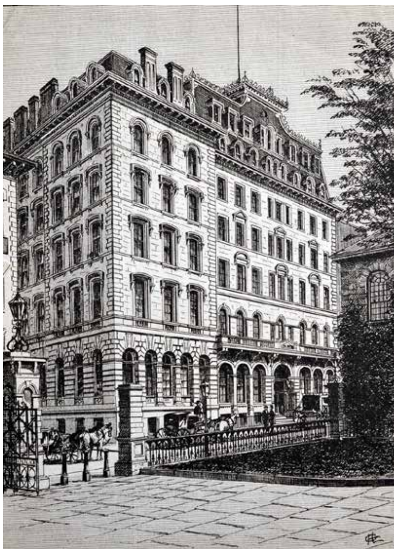
Engraving of the Parker House showing what it would have looked like during the First Meeting of the Yale Club of Boston in 1866