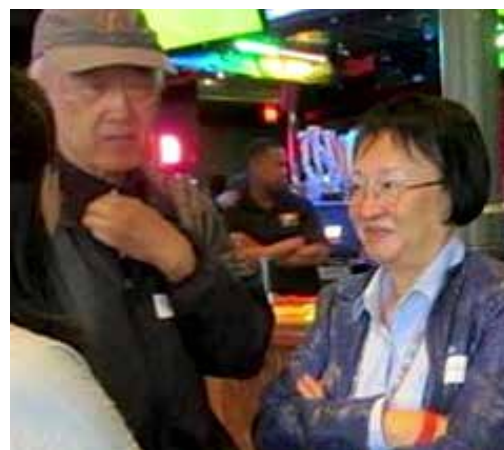
AAAYABoston's innaugural event at Howl at the Moon!

If you would like to sign-up for the AAAYA Boston newsletter or to become more involved please fill out a quick one-minute survey at: https://docs.google.com/forms/d/19PeytZK441lvOhlz0mXlu-Qgd3_d1BTonZ0sCMh2J2M/viewform?c=0&w=1